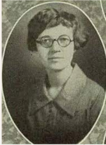
Ruth H. Whipple

Ruth Huston Whipple was Plymouth's first female elected city commissioner (1934-1949) and first female mayor (1940-1942). She worked tirelessly to improve the lives of children and families in the City of Plymouth.